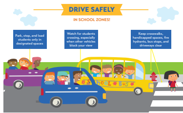
Alta's tips sheets for the King County Metro, WA SRTS Toolkit provide important tips about how to walk, bike and drive safely in school areas.

From developing outreach campaigns and teaching walking and biking safety skills, to reaching thousands of families through International Walk to School Day events, our work creates community excitement around active and healthy transportation options.