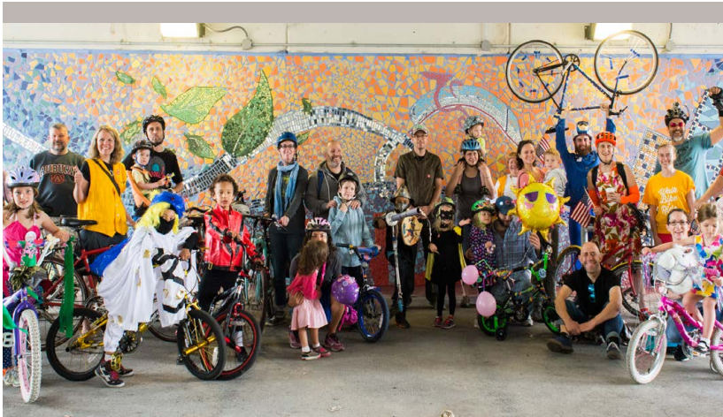
Alta partners with community groups and organizations already serving school communities to enhance connection to program services.