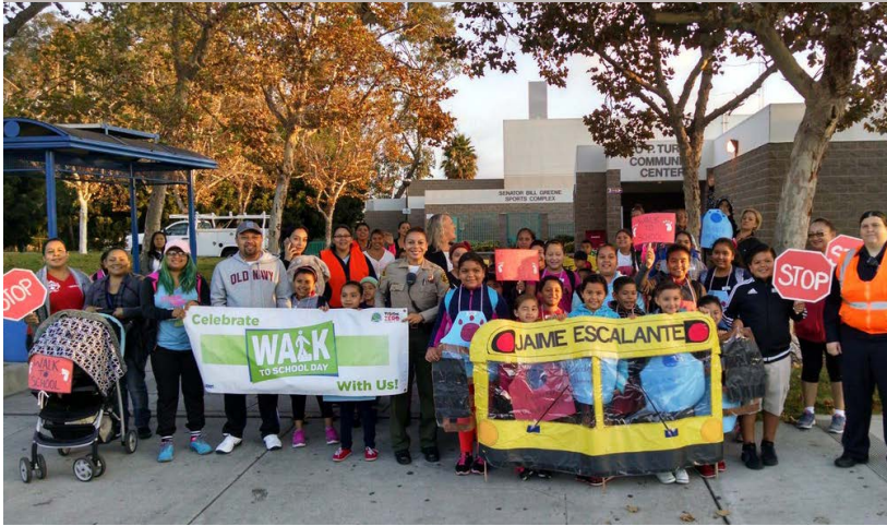
Tailoring programs to the community involves working with local leaders and families to create unique logos, graphics, and materials that resonate.