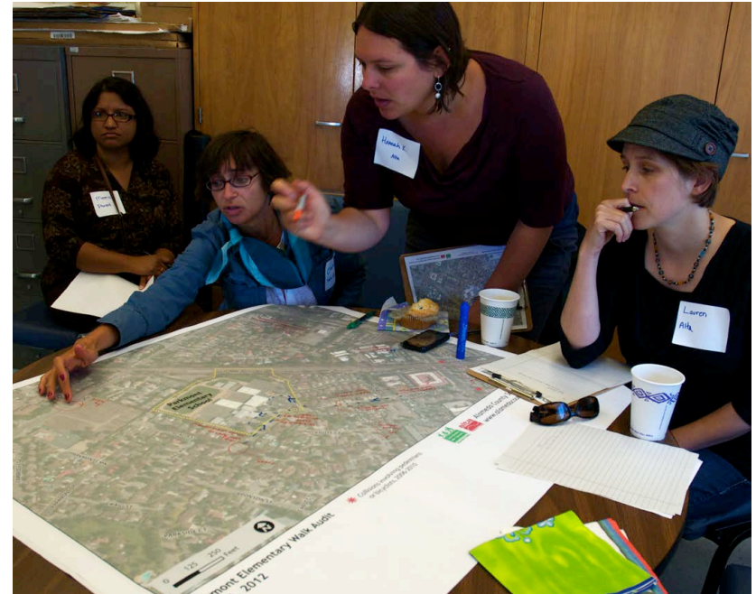
Alta offers a comprehensive package of SRTS project management and program development services.