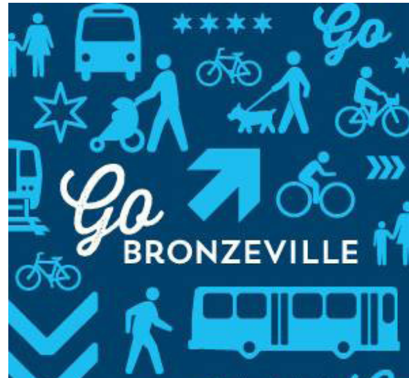
Go Bronzeville is a new individualized marketing program that Alta is leading, aimed at helping Chicago residents walk, bike, ride, and share cars more often.