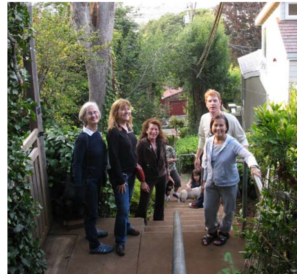
Residents of Marin County enjoy a guided walking event.