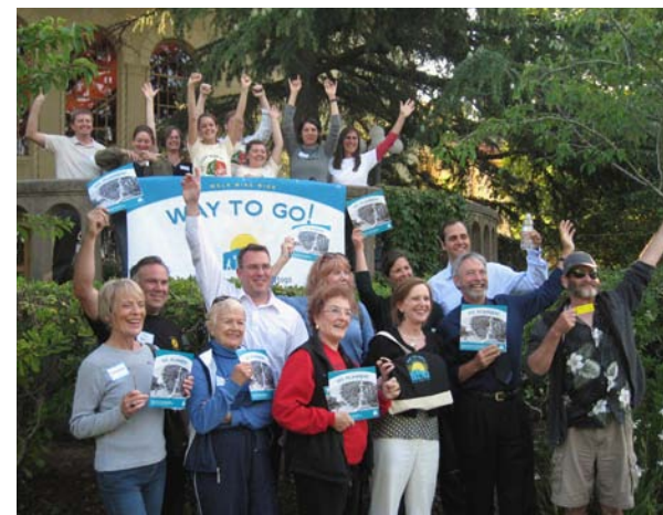
Participants in the Way to Go! Sausalito program celebrate at the kick-off event encouraging walking and bicycling.

Campus plans and programs can help universities reduce their carbon footprint.