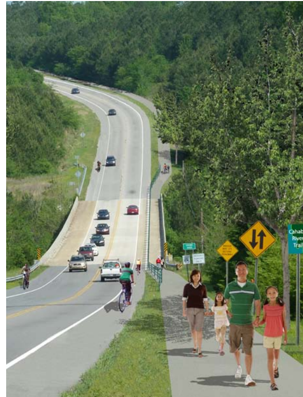
Recent successes include a $10 million TIGER grant award for an integrated regional on- and off-street walking and bicycling network for the City of Birmingham, Alabama.

Arlington, VA Dallas, TX Salt Lake City, UT Atlanta, GA Davidson, NC San Diego, CA Baltimore, MD Denver, CO San Rafael, CA Benicia, CA Durham, NC Saratoga Springs, NY Bentonville, AR Greenville, SC Seattle, WA Berkeley, CA Jacksonville, FL St. Louis, MO Boston, MA Los Angeles, CA Vancouver, BC Bozeman, MT Portland, OR Chicago, IL Sacramento, CA