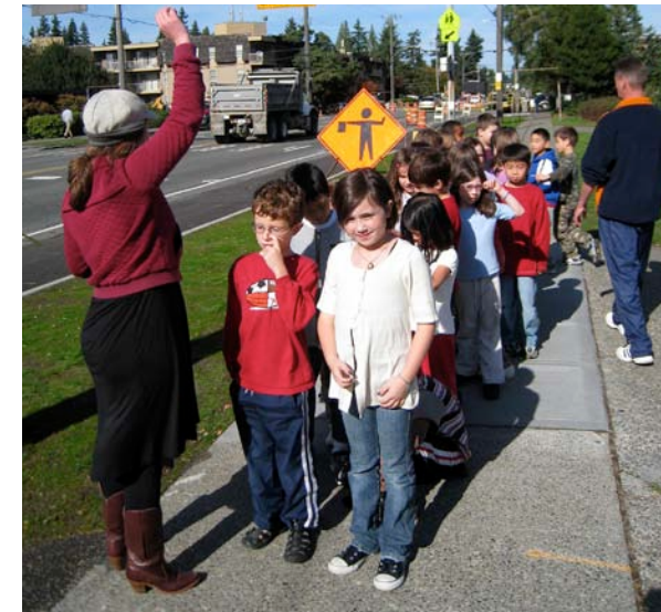
Pedestrian safety education classes teach second-graders how to cross the street safely.